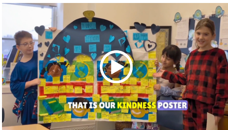
Lumen Academy (Waltham, MA) - Pre-K to Grade 8 students created essays & videos under a "kindness umbrella," building an empathy-driven culture.