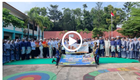
SMPN 29 Batam (Indonesia) - 951 students and 32 teachers fused creativity and kindness, raising compassionate future leaders.