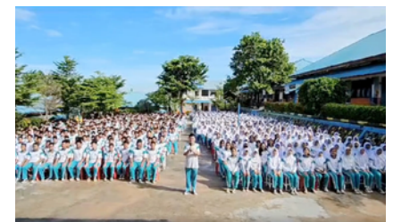
2,000 school principals and teachers from 5 cities in Indonesia attended a webinar introducing Gan Jing World