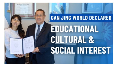
Gan Jing World is Declared of Provincial, Educational, Cultural, and Social interest in Santiago Del Estero, Province of Northwestern Argentina