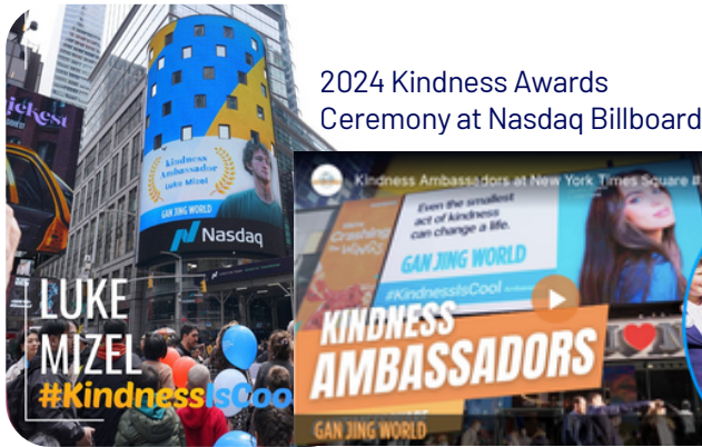
2024 Kindness Awards Ceremony at Nasdaq Billboard

Winning kindness artworks will shine on a global stage