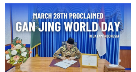
March 28, 2024 Declared Gan Jing World Day in Batam, Indonesia, recognizing impact of the #Kindness event.