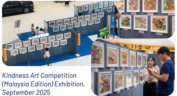
Kindness Art Competition (Malaysia Edition) Exhibition, September 2025